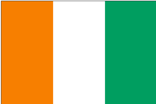
Where In The World