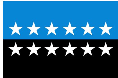
The Flag of the European Coal and Steel Community (1986 - 2002)