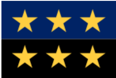
The Flag of the European Coal and Steel Community (1958 – 1972)

The flag was dropped when the European Coal and Steel community merged with the European Union in 2002.