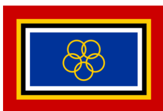
The Flag of the Western European Union (1949)

Belgium, France, United Kingdom, Luxembourg and the Netherlands signed the Treaty of Brussels in 1948 the military organisation of the Western European Union was created. The flag was rarely used and now Western European Union activity ended in 2011, the flag is no longer flown.