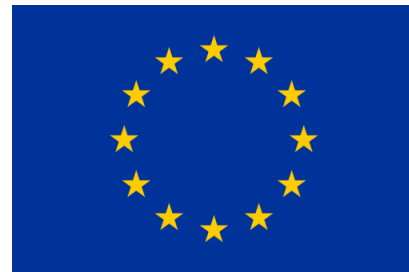
The Flag of Europe (1955 to Present Day)