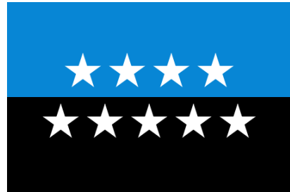
The Flag of the European Coal and Steel Community (1973 - 1980)