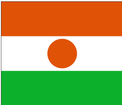
Where In The World