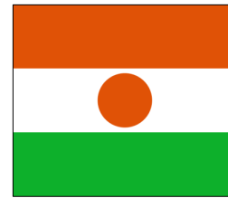
The Flag of the Republic of Niger (1959 to Present Day)