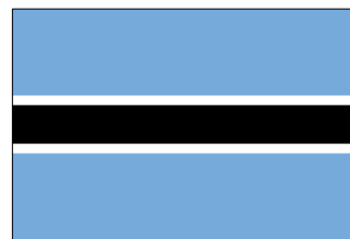
The Flag of the Republic of Botswana (1966 to Present Day)