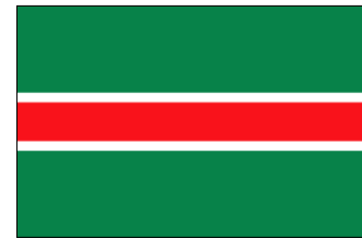
The Ensign of the Botswana Defence Force Air Wing