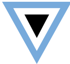
The Roundel of the Botswana Defence Force Air Wing