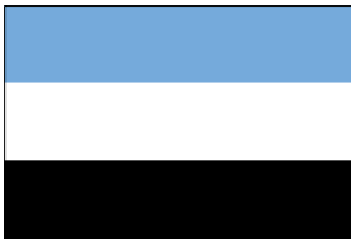
The Fin Flag of the Botswana Defence Force Air Wing

The Fin Flag of the Botswana Defence Force Air Wing is a blue-white-black horizontal tricolour that takes the colours from the national flag. The Roundel of the Botswana Defence Force Air Wing is a upside down triangle with the colours of the national flag. The Ensign of the Botswana Defence Force Air Wing is a green two green bands with a red band with white border in the centre. The upper green band represents the military uniform and the lower band represents the environment. The red band in the centre represents the blood that has been and will be shed.