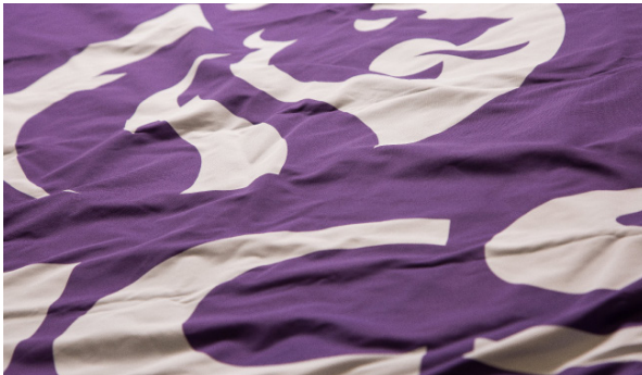
Printed / Dye Sublimated

When you order a flag from Flagmakers, you're getting more than just a flag. You are dealing with the UK's longest established flag maker, guaranteeing the expertise, care, and attention that goes into making each flag. We lovingly produce a huge range of standard and bespoke flags here in the UK and are pleased to help, whatever your needs.